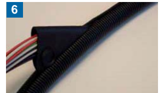
6 See figure 4-6.