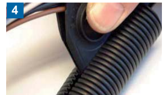
4 Slowly pull tool with cables...