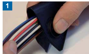
1 Push tool over cables