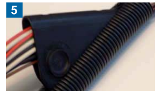
5 ...through corrugated tube.